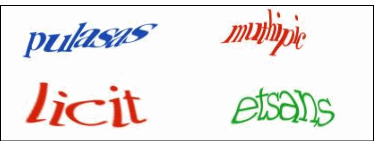
Figure 3. Some examples of Google Captcha

Class 3 consists of Google captchas. Google uses only 2 colors to create captchas: red, green or blue for the text & white for the background. Thickness of characters varies from portion to portion. Global Warping is also applied on text. String length varies between 5&8 characters and only lowercase letters are used. Multiple font typefaces & styles (Bold, Italics, regular) are used. Initially preprocessing is done and for segmentation Forepart Based segmentation method [2] is used. Some of the Google captchas are shown in figure 3.