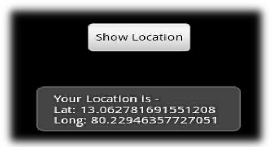
Figure 3 GPS Location

The Android OS combined with a phone's GPS allows developers to access a user's location at any given moment within a distance. The figure 3, shows the output containing the latitude and longitude of the phone's current position.