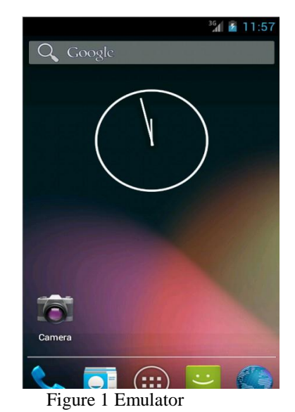
The emulator shown in figure 1 is used while running the app in a local host using Apache Tomcat.

Android has a couple of Java core library and it has added additional libraries to provide support for development of the android application. Android mobile application is responsible for executing stored commands. For developing this Android application, Android SDK and Eclipse were used. A comprehensive set of development tools is included in the Android software development kit (SDK). Eclipse being the officially supported integrated development environment (IDE) uses the Android Development Tools (ADT) Plug-in for Android development.