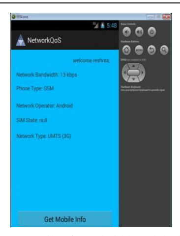
Fig.3: Details of Bandwidth and device parameters