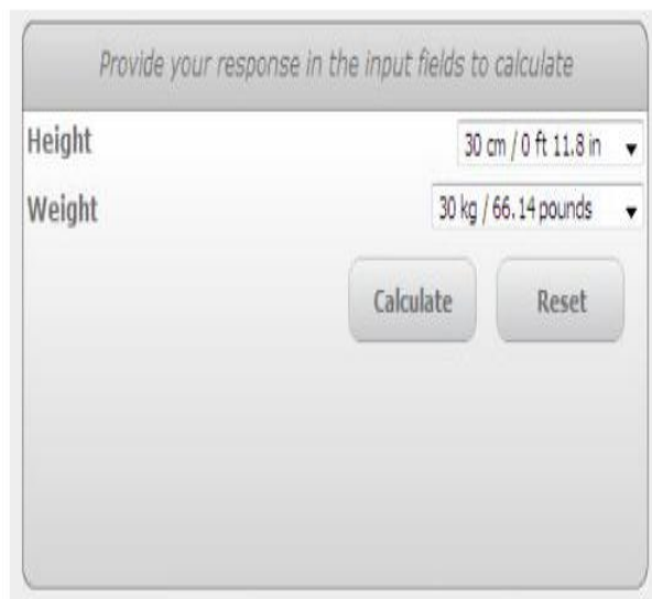
Figure 3 : BMI calculator