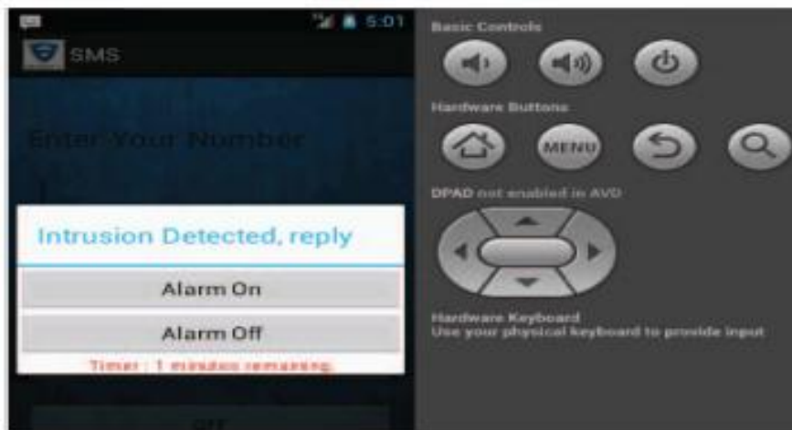
Figure 8 : Pop up on receiving an intrusion SMS from the saved number.

user receives an SMS when a third party tries to enter his house in a remote location. The minimum requirement at the user end is that the mobile device should have an ANDROID OS. ANDROID is a java based operating system which runs on the Linux 2.6 kernel. It's lightweight and full featured. ANDROID applications are developed using Java and can be ported to new platform easily thereby fostering huge number of useful mobile applications [6]. A hardware circuit with a switch and a GSM modem embedded should be installed and connected to the door of the house. When the intruder tries to open the door, the switch triggers an interrupt and subsequently sends a signal into the microcontroller which subsequently triggers the GSM modem to transmit a warning SMS into already registered number in the modem. The SMS on the users' end is interpreted by the ANDROID Application and if it finds that the SMS is from the designated number; the application immediately informs the person with a frequent pop-up menu. If the user positive acknowledge the pop-up in 1 minute, an acknowledgement is send back to the remote GSM modem. The modem will output an interrupt to the microcontroller and the microcontroller will subsequently trigger an alarm. If the user fails to acknowledge in the defined time interval, an automatic positive acknowledgement will be sent by the application to the modem and the activities follow.[7]