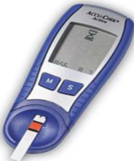
Figure 2 : Accu-chek

The mobile phones can also be used as for analyzing the diabetes or the sugar level. It can use the concept of “Accu-chek glucometer” for monitoring the level of sugar or the diabetes level. The original Accu-chek is generally large in shape, so accu-chek cannot be directly used here since, it will not be feasible with it. So, the software used inside the device Accu-chek is used. The figure of the device accu-chek is in Figure 2.