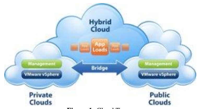
Figure 1: Cloud Types

Cloud computing is a model for enabling ubiquitous, convenient, on-demand network access to a shared pool of configurable computing resources (e.g., networks, servers, storage, applications, and services) that can be rapidly provisioned and released with minimal management effort or service provider