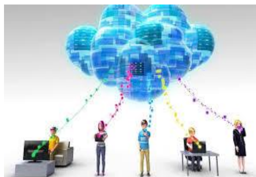
Fig. 3- Future of Computing Industry

The penetration of cloud computing in daily life and businesses has been commendable. From social networking to running large corporates, cloud services have proven to be reliable, fast and cost-friendly option. But there are still some concerns as discussed which plaque this platform. If developers are to overcome or at least minimize the negative effects of cloud services, it is surely poised to become a massively adopted technology in various fields like mobile systems, database management etc. in future.[12]