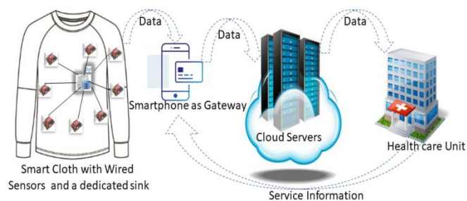
Figure 1 : Data flow structural design from Smart Wear to Healthcare Unit in consort with the flow of Service Information

The emerging research challenges in this context include followings:-