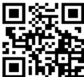
Fig.2 2-D Barcodes