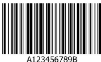
Fig.1 1-D Barcode