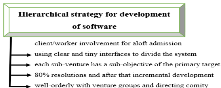
Figure 1. The progressive approach's five primary standards. Adopted from [10]

According to Jacobi and Rumpe (2001), the Extreme Programming (XP) approach can be developed by incorporating features of different-leveled techniques. They agreed to use the XP approach to create the hierarchical structure. By adhering to the lightweight approach, it is possible to break down large projects into a collection of smaller XP endeavors that have the same overall goal to achieve. However, as a result of combining and adjusting each XP standard with those from the hierarchical redesign technique, five essential standards were developed in this different-leveled process. These standards are as follows: Client involvement for aloft confirmation; use of concise, unambiguous interfaces to divide the system; each sub-venture has a sub-objective of the primary target; 80% decisions, followed by gradual development, and well-orderly with project gatherings and advice community. [10].