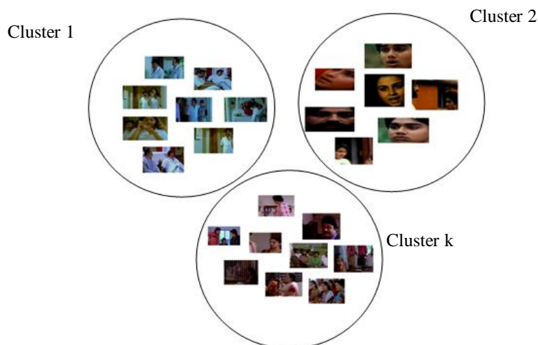
Fig 4: Clusters of video shots

shots are discarded. Using this method matching between shots using high dimensional feature vectors is done only for fewer numbers of shots. So time complexity in similarity matching of high dimensional feature vectors is considerably reduced. This reduces overall search time complexity.