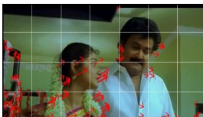
Fig 2: Motion vectors in frame