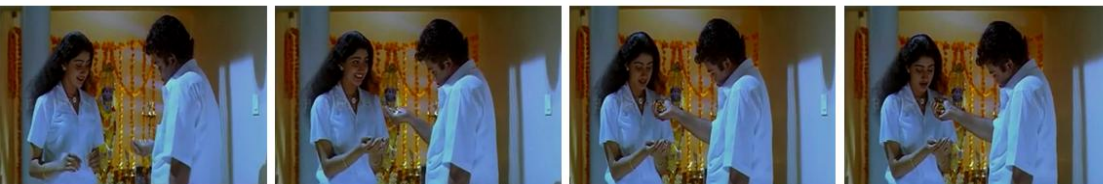
Fig 3 : Results

Shot length feature gives the length of the each shot. Shot length of first and last shot in a query is not extracted for matching shot length between shots in database and query. Only the shots which lie between first and last shot are considered for extracting shot length. Suppose our query is part of movie, in this case first and last shot of the query may contain only a part of original shot.