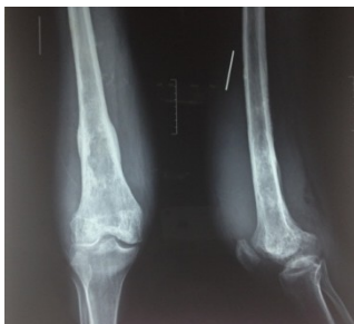
X-RAY (Fig1.1) shows lytic lesion in the distal metaphysis

23 year old gentleman had pain and swelling in the right distal thigh for three years. Pain increased in intensity and swelling progressed in size. Presented to us with pain and swelling. On examination patient had diffuse swelling extending from knee to mid-thigh, globular in shape, dilated veins seen. Right knee range of movements: FFD 10degrees, flexion 10-45 degrees with foot drop. Hemoglobin was low; Serum calcium, alkaline phosphatase and phosphorus were within normal limits.