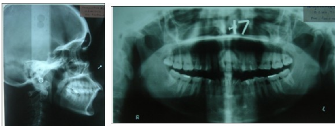
Fig 2: Pretreatment Radiographs

Cephalometric analysis revealed class II skeletal base with bimaxillary protrusion with ANB of 6^{\circ} patient present with average to vertical growth pattern with mandibular plane angle of 30^{\circ} and y-axis of 70^{\circ} (fig 2). The upper and lower anteriors were proclined according to Steiner's analysis. Excessive eruption of upper and lower incisors was noted according to Burstone analysis. This excessive eruption of incisors is seen in patients with vertical maxillary excess in order to partially compensate for the jaw rotation. The vertical maxillary excess, thin alveolar troughs, excessive curve of spee, proclined upper and lower anterior teeth, excessive eruption of upper and lower incisors warranted a surgical line of treatment (Table).