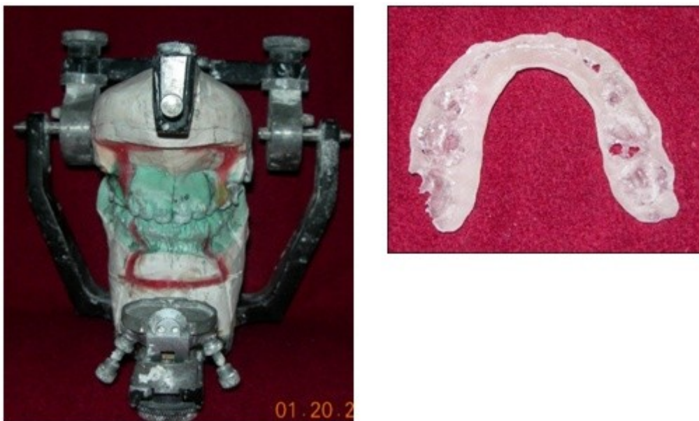
Fig 5: Mock Surgery and Surgical splints