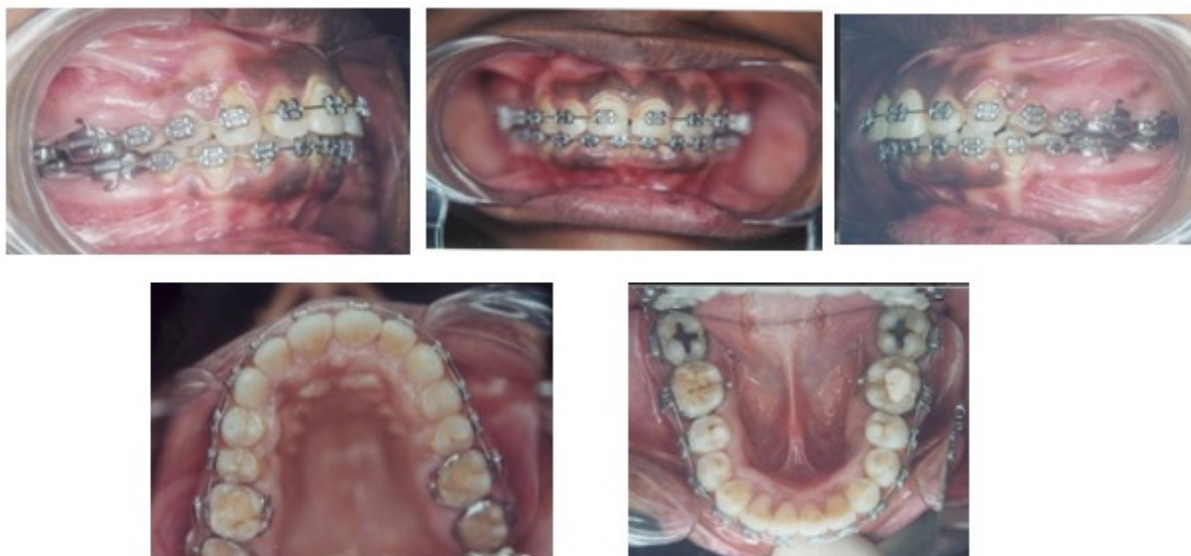
Fig 3 Intra oral photographs of Alignment & Levelling

resulted in decrease in the maxillary anterior teeth proclination and deepening of the bite. Initial alignment wire was started with 0.016" nickel titanium wire in the mandibular arch as well and gradually increased to 0.019X0.025" stainless steel wire. Levelling of anterior segment was planned surgically by intruding the anterior segment because of the thin alveolar trough so as to avoid root resorption.