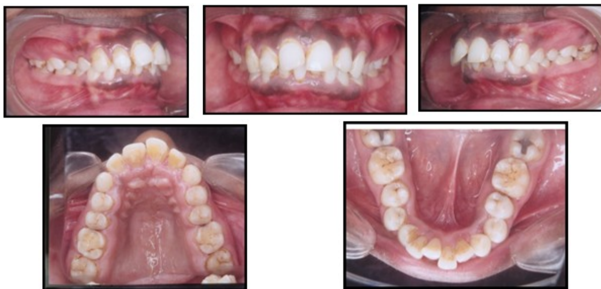
Fig 1: Pre Treatment Extraoral and Intra oral Photographs