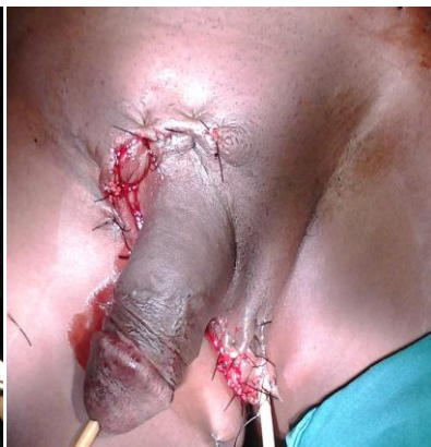
Figure 1d: wound closed