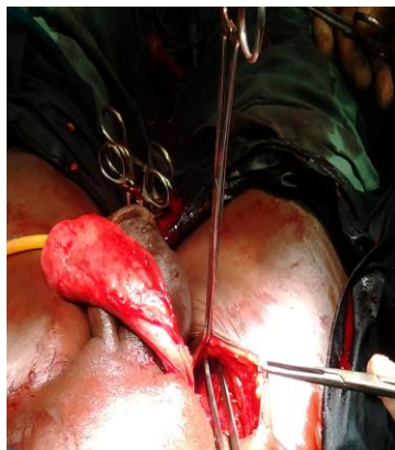
Figure 1c: tunnel for testes