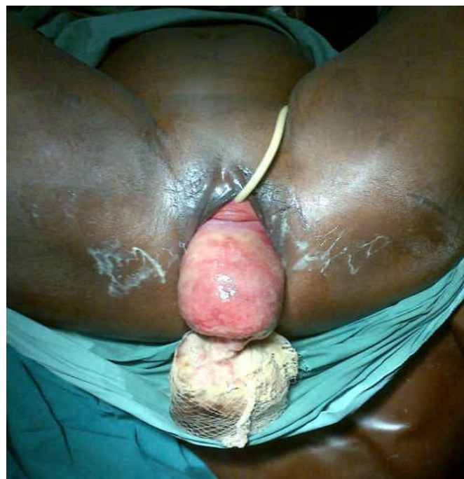
Figure 1 – Patient with prolapsed submucous myoma and associated uterovaginal prolapse. Sofratulle gauze over necrotic mass and zinc oxide paste applied on decubitus ulcer and adjacent areas. Urethral catheter in-situ.

She was seen at the gynaecology out-patient clinic three (3) weeks later and her clinical condition was found to be satisfactory. Her histopathology revealed normal uterus, ovaries and Fallopian tubes, acute-on-chronic cervicitis and necrotic submucous leiomyomata. Her subsequent follow up visits have been uneventful.