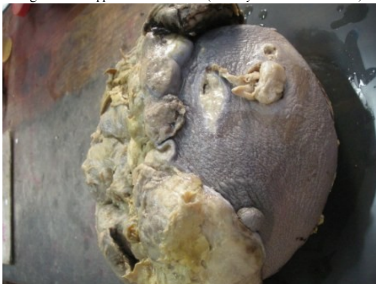
Fig 4. Gross appearance of tumour(Primary fibrosarcoma breast)