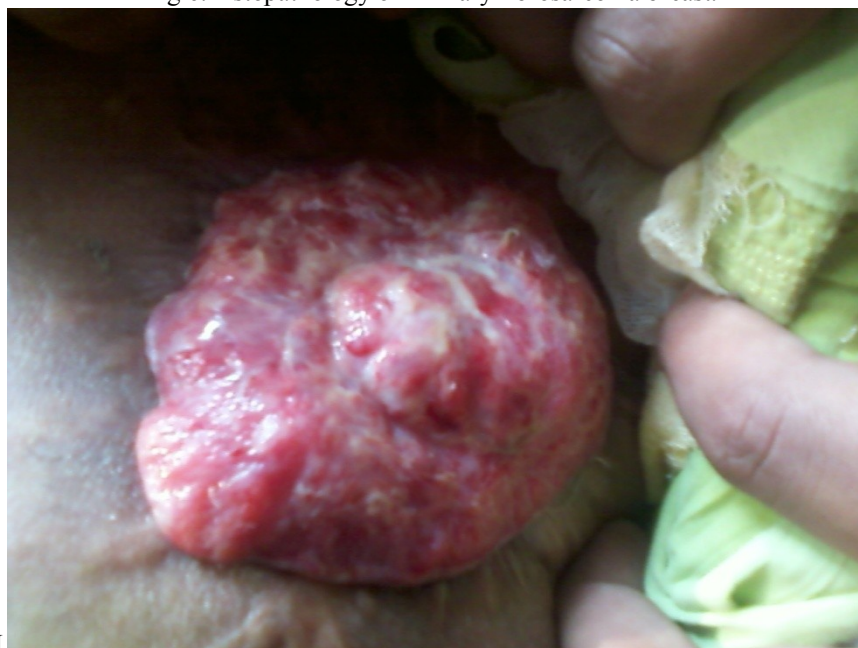
Fig. 7. Recurrence of tumour at the primary site