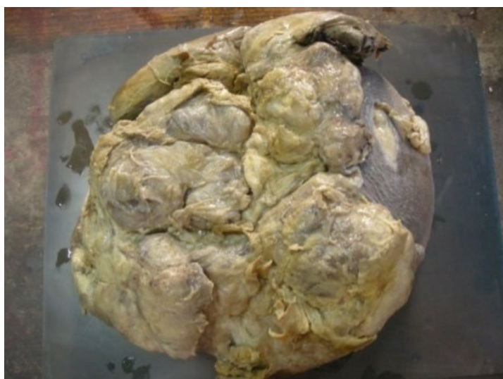
Fig 3 .Gross appearance of tumour.(Primary fibrosarcoma breast)