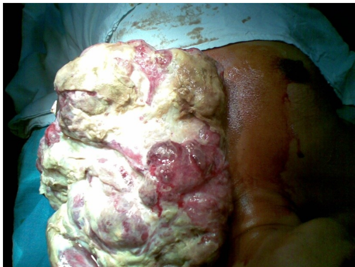
Fig 2. Primary fibrosarcoma breast