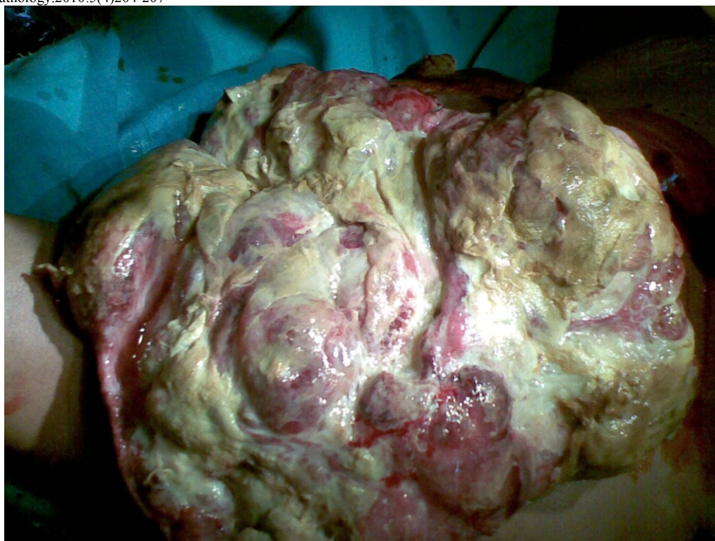
Fig 1. Primary fibrosarcoma breast