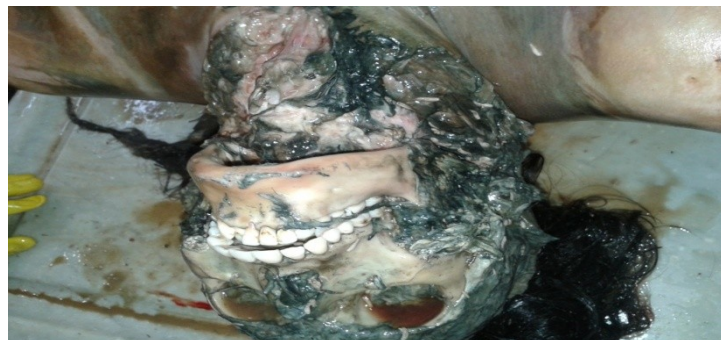
Fig (2): Post-mortem disfigurement of the face