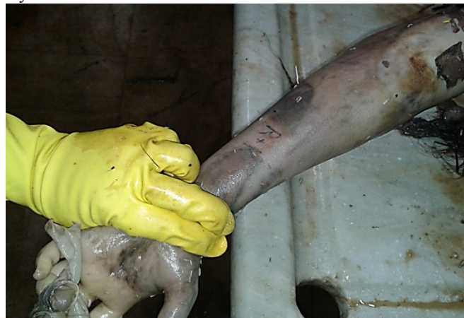
Fig (4): Tattoo on the volar aspect of left forearm showing "R+K"