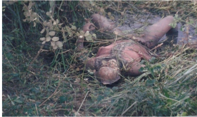
Fig (1): Body found at the place of occurrence