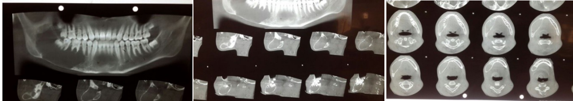
Fig. 1. Radiographic imaging showed radiolucent lesion on right side of lower jaw, well- defined, expansile, unilocular