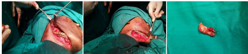
Fig. 4. Intraoperative fixation of the autogenic graft with titanium plate and four screws and removal of the bony lesion