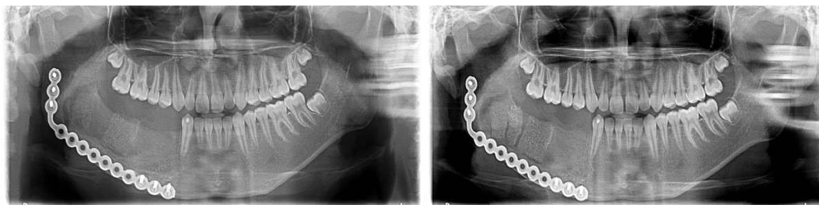
Fig. 5. Postoperative X ray

Histopathology report of the resected specimen showed fibrocellular connective tissue wall of mixed density, loose connective tissue in some areas and dense bundles of collagen fibres in most other places. The connective tissue shows many forming blood vessels and multinucleated giant cells (fig 6 ). There is no evidence of epithelial lining. Peripheral bone formation is evident.