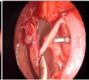
Figure 3: Bowman's probe seen through lacrimal sac opening