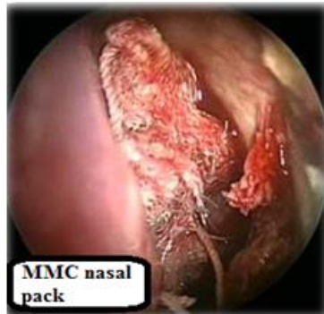
Figure 4: Nasal cavity packed with cotton gauze soaked with Mitomycin-C (MMC)