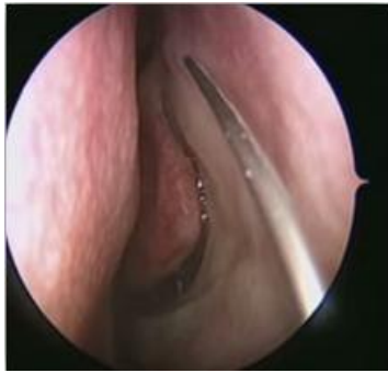
Figure 1: Infiltration of local anesthesia