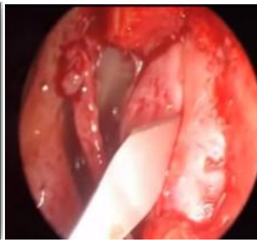
Figure 2: Incision along the sac wall