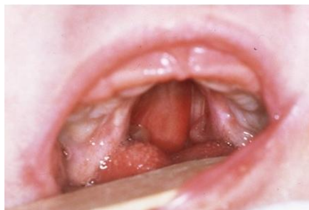
Fig. 2: Patient with cleft palate