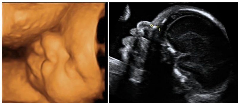
Fig. 4 : Timeliness developed fetus with left-sided cleft lip and palate

Clefts in unborn babies are often detected with an ultrasound examination during a routine antenatal appointment. This antenatal scan typically takes place at around 20 weeks ( FIG 4 ). The accuracy of sonography for prenatal diagnosis of cleft lip and palate is highly variable and dependent on the experience of the sonographer and the type of cleft. Reported rates of detection for cleft lip and palate range from 16% to 93%. Isolated cleft palate is rarely identified prenatally. Furthermore, even when a cleft lip is visualized sonographically, it is difficult to determine whether the alveolus and secondary palate are also involved.[4]