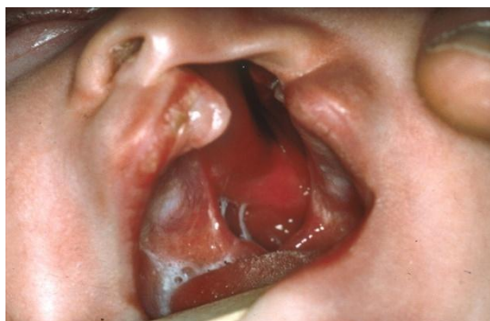
Fig.3a: Patient with left-sided cleft lip and palate