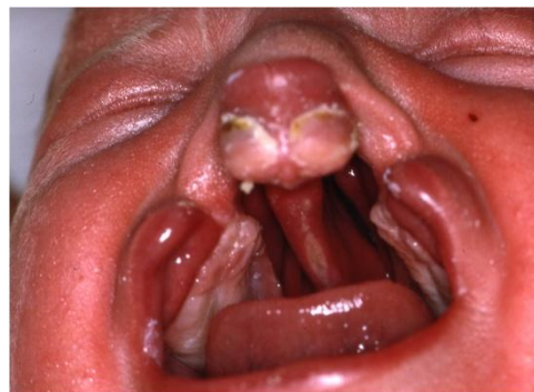
Fig.3b: Patient with bilateral cleft lip and palate

Epidemiologic studies of isolated (i.e., without other malformations or syndromes) cleft lip and/or cleft palate have been conducted worldwide, often resulting in varying prevalence rates. Differences in geographic and ethnic distributions may account for some but not all of the variations. Other factors contributing to the diverse figures are the inclusion criteria used to group cleft types (i.e., CL ± P versus CP) or define the cleft population (i.e., all cases of cleft including other birth defects versus cases of isolated cleft).[1,2]