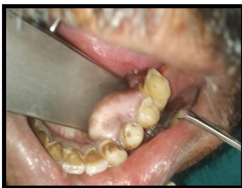
Fig 1: Intra oral view of the swelling