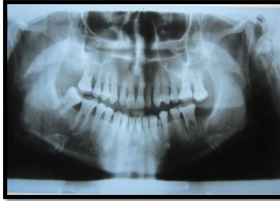
Fig: 2 Ortho Pantomogram Radiopaque shows lesions with radiolucent foci seen in the interdental regions of 33, 34, and 35 suggestive of calcifications.