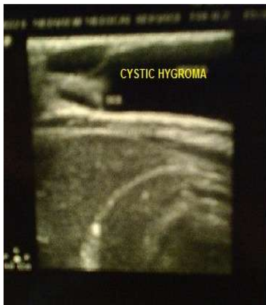
Fig 3: Ultrasonography showing septated cystic lesion between skin and muscle.

Histopathology: Consistent with cystic hygroma (Fig 4).