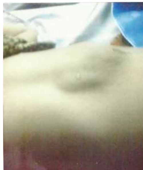
Fig 2: Same cystic hygroma: close up view