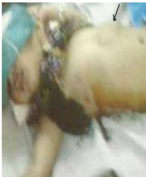
Fig 1: The baby with cystic hygroma of upper abdominal wall: Marked with an arrow

A one year old male child came to our clinic with a painless swelling over the left side of upper abdomen since birth. There was no history of trauma, fever or pain. The child had a normal vaginal delivery. On examination there was a smooth swelling, 8 cm X 4 cm in size, situated over the left side of upper abdominal wall. There was no skin changes and no pulsation. The swelling was soft, partially compressible, non tender, fixed to skin and deeper structure. It was translucent, having no impulse on straining (crying). There was no audible sound on auscultation. Rest of the examination was normal (Fig 1 & 2).