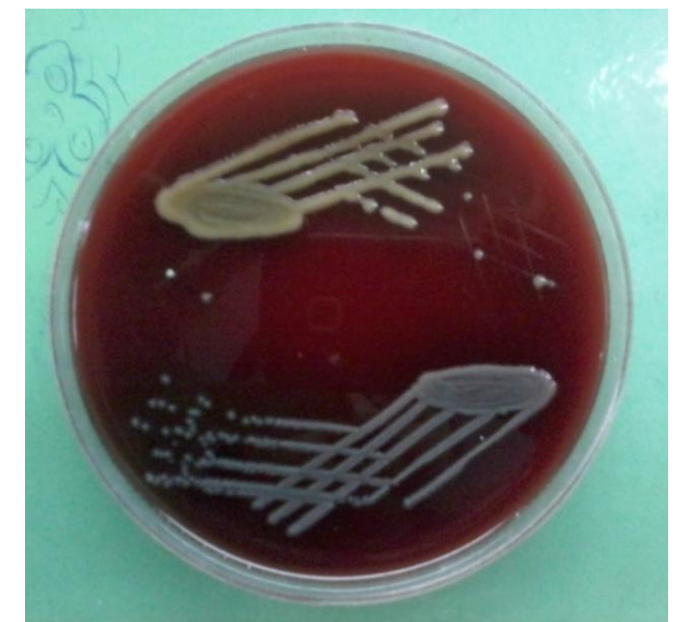
(figure 2):Yellow pigmented colonies of C. sakazakii compared with white colonies of Enterobacter aerogens ATCC 13048.

MacConkeys agar showed lactose fermenting, smooth, circular, raised, entire margin colonies, 3-4 mm colonies. After examination of colonies, they were inoculated for biochemical reactions and AST. The blood sample of the patient was also cultured. It also revealed similar colonies. However, the AFB examination of the patient was negative(both microscopy and culture).