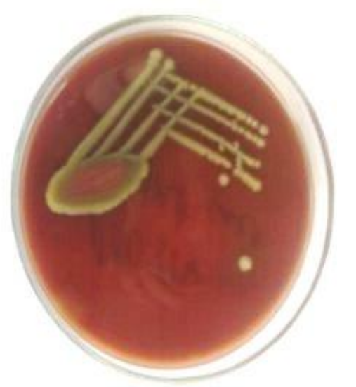
Figure 1: Yellow pigmented colonies on C. sakazakii on Blood agar. <sup>[3,4]</sup>

Next day on blood agar 2-3 mm, yellow pigmented, circular, raised, entire margin, smooth surface, non-haemolytic colonies were present which were catalase positive and oxidase negative.