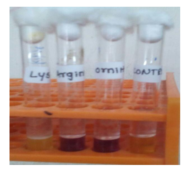
figure 3: Moeller's decarboxylase media

Biochemical reactions- Indole -negative, Methyl red-negative, VP-positive, Citrate-positive, Urease-negative, TSI-Acid/acid with abundant gas. Nitrate was reduced to nitrite and Ortho dinitrophenyl beta galactoside(ONPG) was hydrolysed.