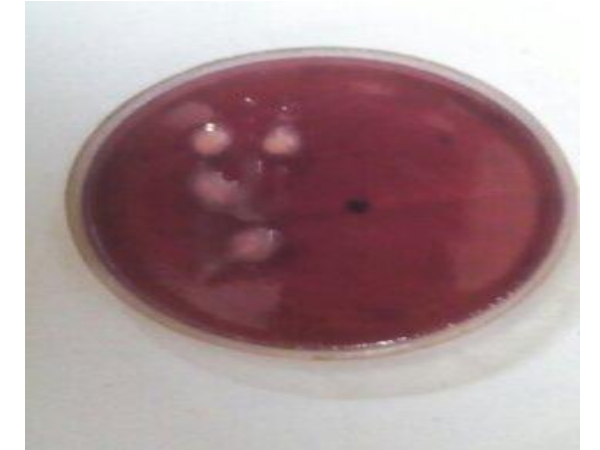
Figure 5-Pinkish purple colonies of C.sakazakii on Violet red bile glucose agar.