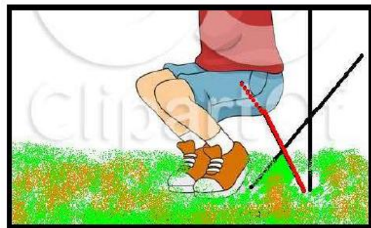
Illustration 2 : Showing extent of injury limited by feet resting on the ground

The experience of management of penetrating rectal injuries in civilian population continues to be based upon destructive injuries encountered during wartime conflict. The severity of tissue destruction in most civilian rectal injuries is minimal and the tenets of rectal injury management based upon wartime experience do not apply to nondestructive penetrating rectal injuries. Hence, Gonzalez et al (2006) 7 in their experience have suggested need for multi institutional randomized prospective study to assess the non-diversion approach to the management of these non-destructive penetrating rectal injuries.