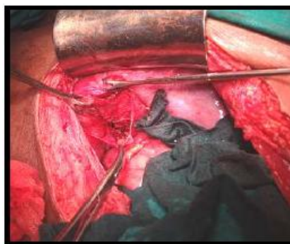
Photo 2: Intraoperative view showing repair of extraperitoneal bladder and rectal injuries.