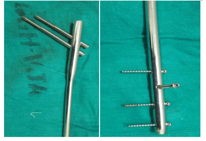
III. Results And Observation

Right and left nails are present because of anteversion of femoral neck . Neck shaft angle is 130° & 135°.