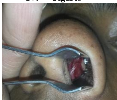
Fig 1 Left sided Nasal mass seen on anterior rhinoscopy