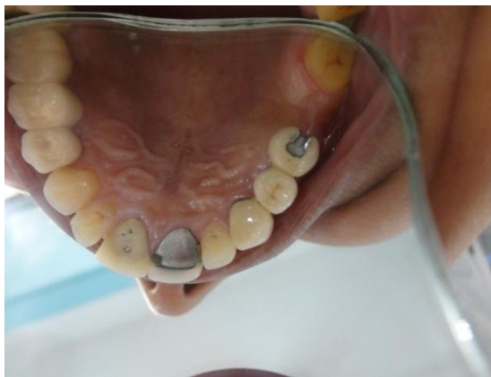
Figure : 6 Cementation of the mesial segment