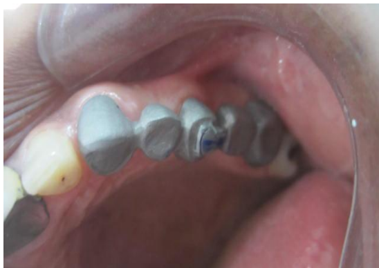
Figure : 4 Metal Try-In