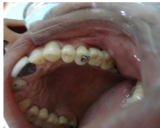
Figure : 7 Final Cementation