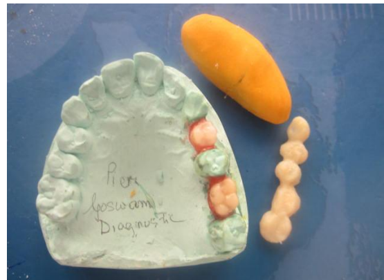
Figure : 3 Temporization