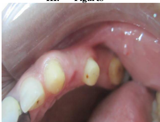
Figure: 1 Tooth Preparation