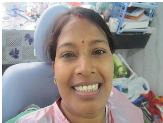
Figure: 8 Patient with cemented prosthesis