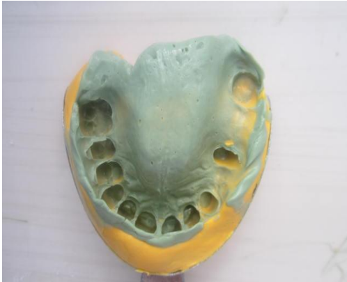
Figure: 2 Final Impression