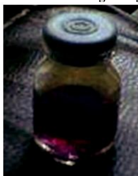
Figure - 1: Rapid urease test showing change in colour to pink

The other two biopsy specimens were sent in formalin solution for histopathology and special staining. Each of the biopsy specimens were fixed in 10% buffered formalin, routinely processed to paraffin and 3 µm sections cut. One section of each biopsy specimen was routinely stained with Haematoxylin & eosin stain and examined microscopically for presence of Helicobacter pylori organisms. The other sections of the biopsy specimen were dewaxed and taken to water and then incubated in 2% Giemsa solution in D-water for 30 minutes at room temperature. After rinsing in tap water, the sections are quickly dehydrated through ethanol solution before being cleared with xylene and examined for the presence of Helicobacter pylori . Histopathology test was given as positive when Helicobacter pylori were detected by routine Haematoxylin & eosin stain and/or Giemsa stain.