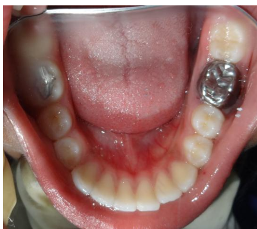
Figure-6. Post-operative intra oral photograph showing Stainless steel crown with respect to 36 and silver amalgam restoration with 46.