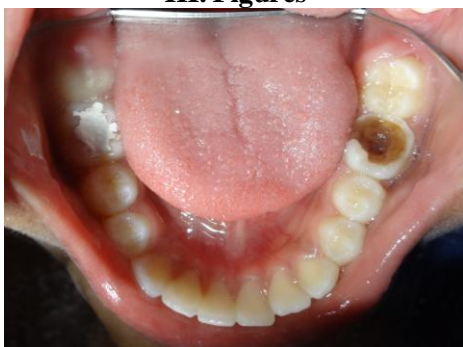
Figure-1. Intra oral photograph showing a large carious lesion involving pulp with 36 and temporary restoration with 46.