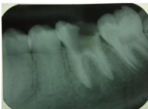
Figure-2. IOPA Radiograph showing a large carious lesion involving pulp in relation to 36 and anomalous root outline in relation to 35.