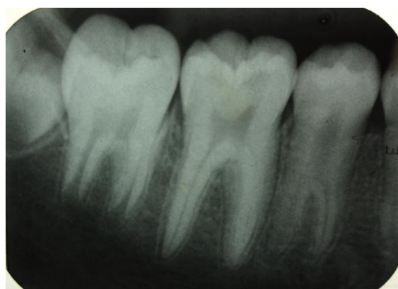
Figure-4. IOPA radiograph showing bifurcated root (M and D) in relation to 45.