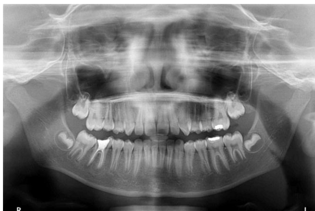
Figure-5. Orthopantomograph (OPG) showing the completed root canal therapy with 36 and presence of bilateral bifurcated roots with mandibular second premolars.