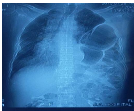
Fig 1: Chest X-Ray showing Abdominal contents Occupying the left chest

Examination findings, X-Ray Chest (fig 1) and CT scan (fig 2) confirm the diagnosis of Bochdaleks Hernia.