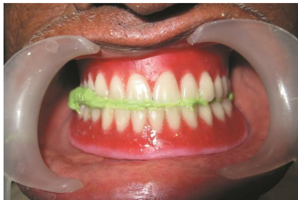
Fig. 6 Protrusive record made.