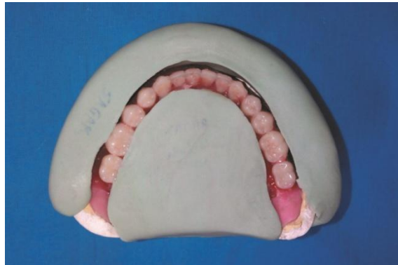
Fig. 5 Teeth setting in neutral zone area