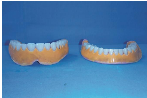
Fig. 8 Second neutral zone record in condensation silicone light body