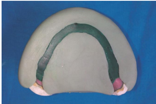
Fig. 4 Neutral zone recorded with green stick impression compound.