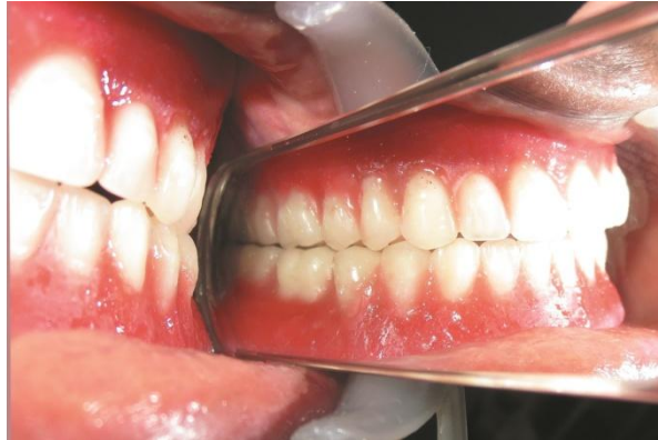
Fig.7. Try-in with balanced occlusion