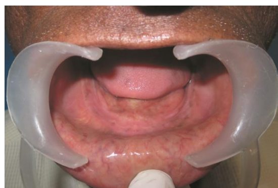
Fig. 2 Mandibular edentulous arch