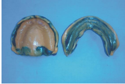
Fig. 3 Maxillary and Mandibular (McCord's technique) final impression