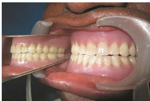
Fig. 10 Denture delivery- teeth in balanced occlusion