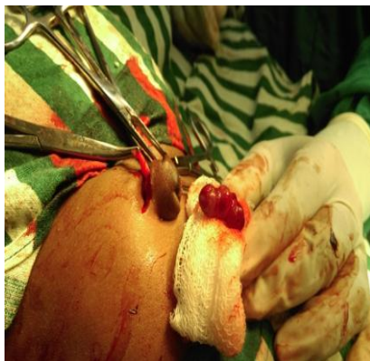
Excised VID by circum- umbilical incision