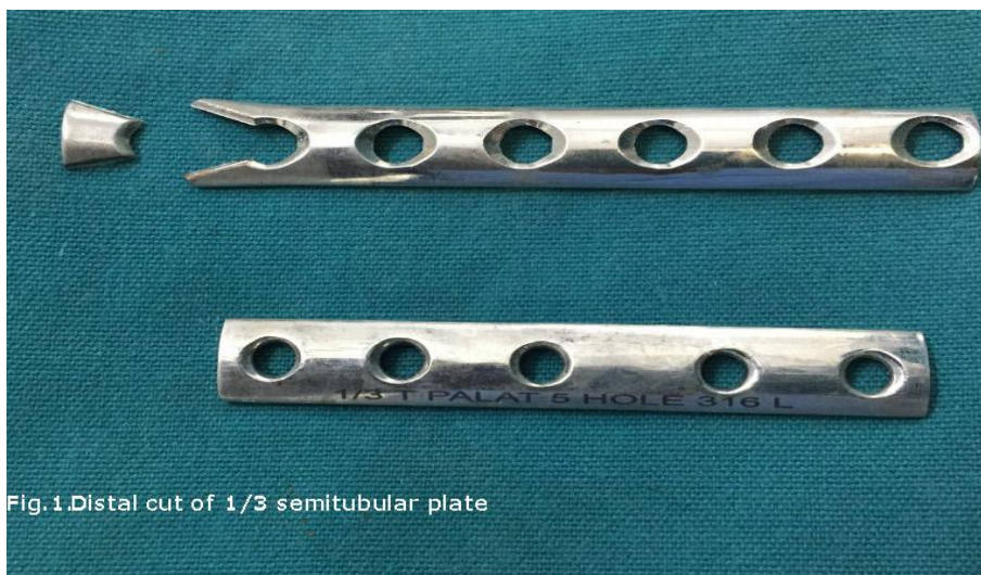
Fig.1. Distal cut of 1/3 semitubular plate

The patients with distal fibular fracture at or below level of the syndesmosis are selected. For these fractures pre-operative planning of plate length is estimated so as to have 3 screws proximal to fracture. A 1/3 tubular [semi tubular] Plate is taken, its ends are cut in 'v' shape (Fig.1) the loose piece discarded and