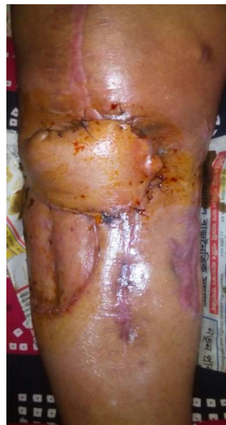
Fig 6: gastrocnemius musculocutaneous flap

Patient was electively planned for plastic surgery intervention and wound was covered by Gastrocnemius musculocutaneous flap. The wound healed uneventfully.