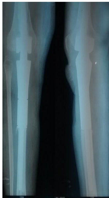
Fig 4: post operative custom made prosthesis

After 6 months patient was electively planned for total knee arthroplasty with custom made prosthesis. Anterior midline incision was given incorporating the previous incision and sent for histopathology. The knee was exposed through medial parapatellar approach. The K-nail was removed and sample was taken from margin of tibia to reconfirm tumour clearance. After appropriate preparation of the distal femur and remaining tibia the prosthesis was fixed with bone cement. The skin was closed in layers.