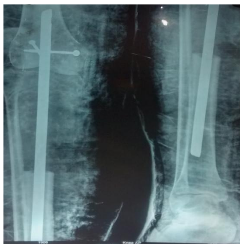
Fig 2: radiograph after tumour excision and stabilisation by K - nail

Debulking of the tumour mass was done outside our institute as evident from the scar over the anteromedial aspect of proximal leg. HRCT Thorax, CECT Abdomen and Bone scan did not reveal any skip or metastasis. In our institute resection of tumour through a separate anterior midline incision over the knee was done. The previous scar of debulking surgery was also excised along with the tumour. Sample was sent from the margin to check for clearance of tumour. Limb was stabilised with a K-nail. Patient was followed up regularly for 6 months to check for any recurrence of tumour and to assure full skin coverage.