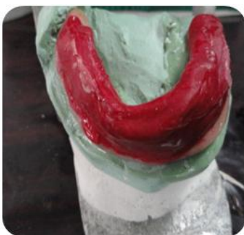
Articulation with neutral zone.