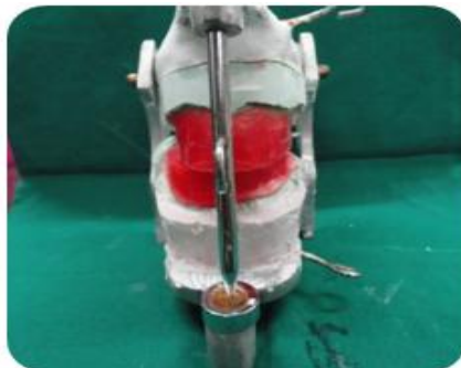
Articulation in Mean value Articulator