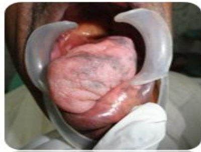
Showing facial Asymmetry OPG showing resorbed mandibular ridge Intra oral view showing resected tongue