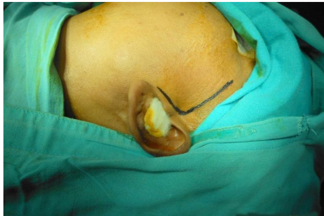
Fig 3: Myrhaug`s preauricular incision