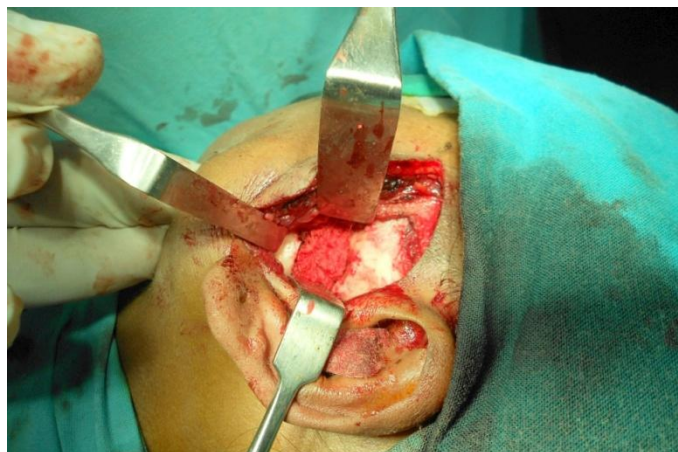
Fig 4: Affected side gap arthroplasty