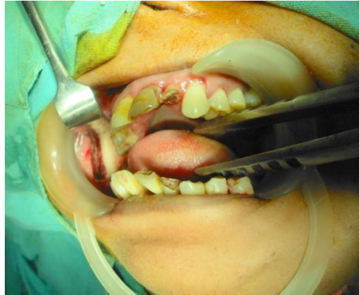
Fig 5: Contralateral coronoidectomy