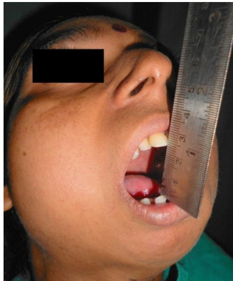
VI. Fig 6: Mouth opening of 24mm