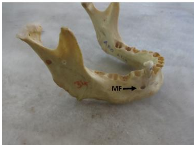
Fig- 5. Showing the mental foramen lies in between 1st premolar and 2 nd premolar teeth. MF- Mental foramen