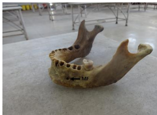
Fig- 3. Showing the mental foramen lies in between 2 nd premolar and 1 st molar teeth. MF- Mental foramen