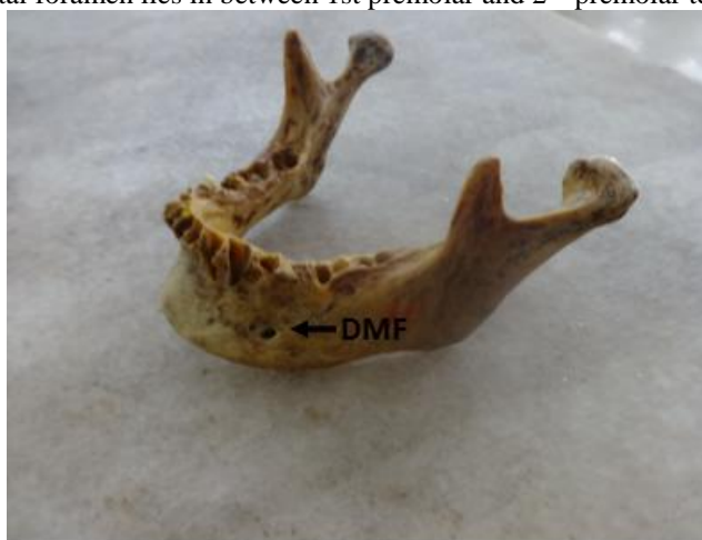
Fig- 6. Showing double mental foramen. DMF- Double mental foramen.