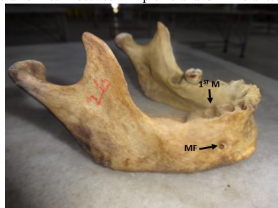
Fig- 4. Showing the mental foramen is in line with 1 st molar teeth. MF- Mental foramen, M- Molar teeth.