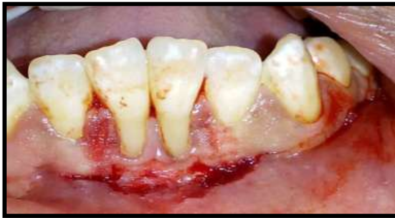
Fig.2: De epithelialization done

After adequate local anesthetic application, the exposed root was planed with a Gracey currettes. Initially Frenotomy was done between 31,41. Then de-epithelialization was done at recipient site.[Fig.2] Tin foil was placed on denuded root surface to know the amount of tissue needed.[Fig.3]