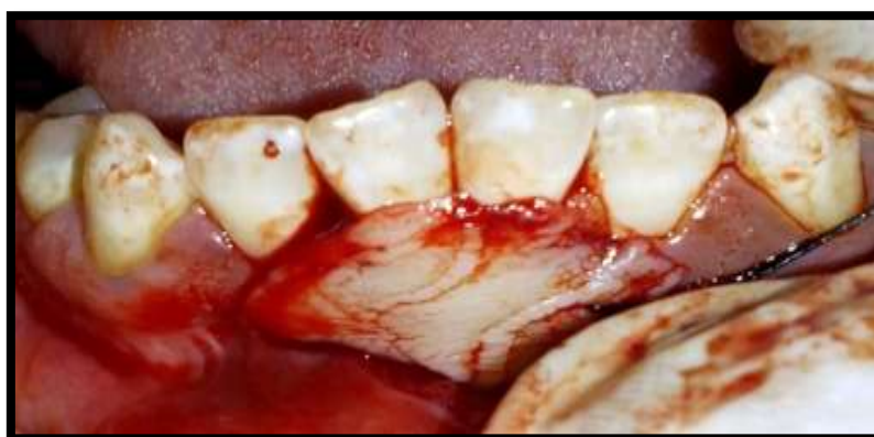
Fig.6: Graft in Recipient site.