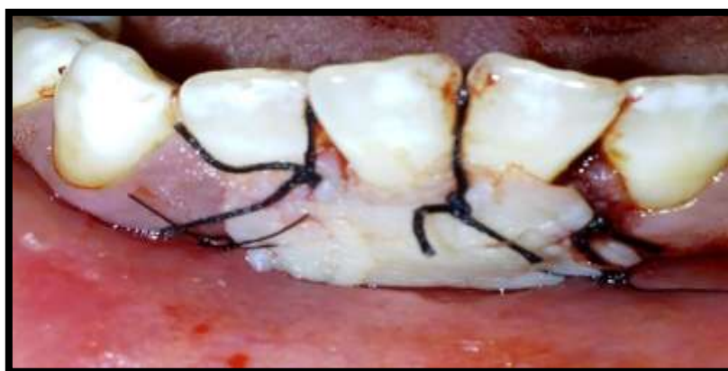
Fig.7: Graft stabilized by sutures.