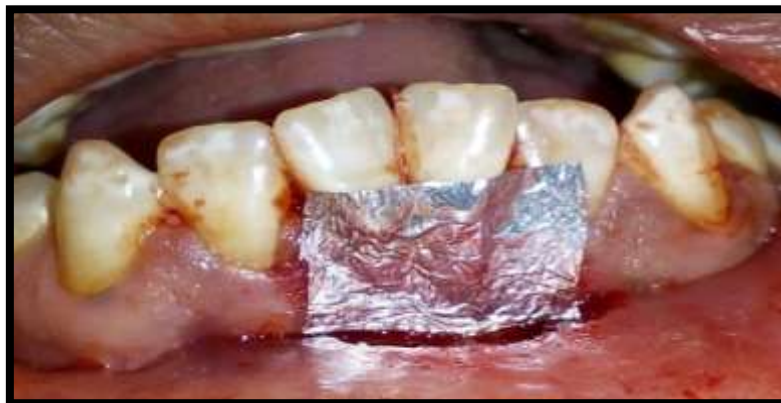
Fig.3: Tin foil placed in recipient bed