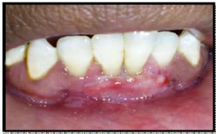
Fig.13: Post-op ( After 1 Month)