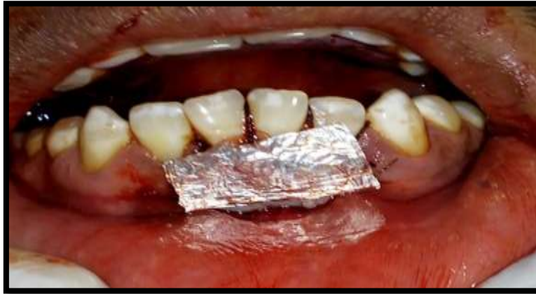
Fig.8: Tin foil placed over the graft