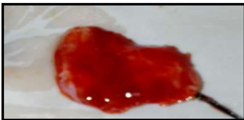
Fig.5: Graft taken from Donor site