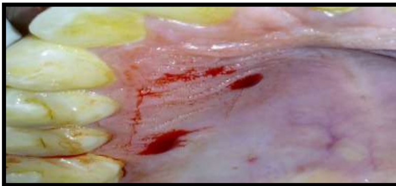
Fig. 4: Donor tissue marked