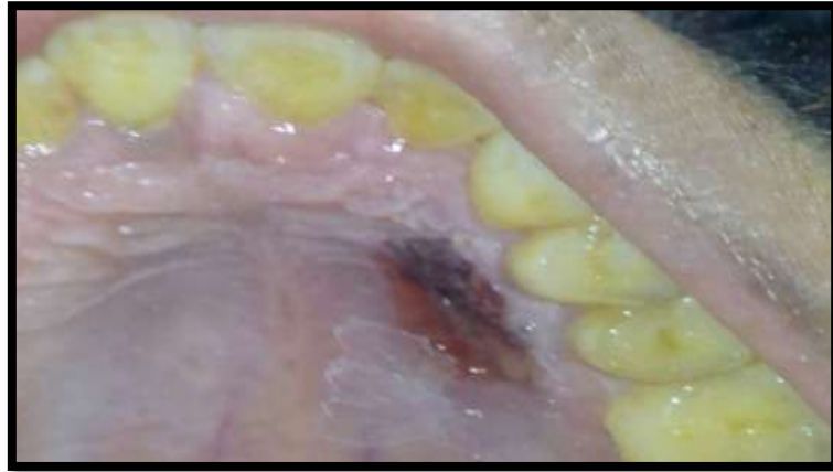
Fig.11: Post-op ( After 3 days)