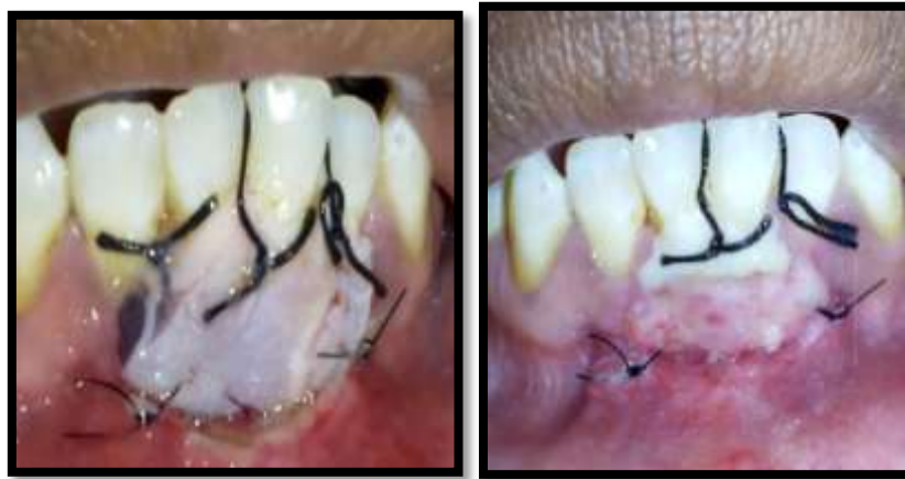
Fig.12: Post -op (After 1, 2 weeks)