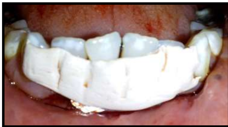
Fig.9: periodontal coe-pack given