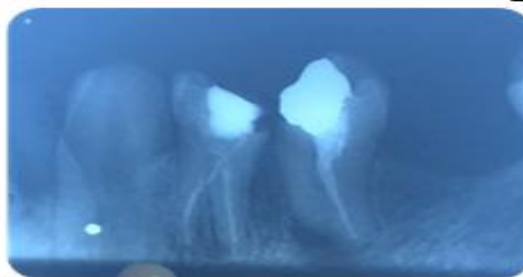
Fig 1: preoperative radiograph

A 21-year-old male patient was reported to the department of Conservative Dentistry and Endodontics at Govt Dental College kozhikkode, with a chief complaint of pain in the posterior right mandibular tooth for the past 2 weeks. Patient's medical history was non-contributory. Patient had a history of root canal treatment for that particular tooth 3 years back. Clinical examination revealed a class II amalgam filled right