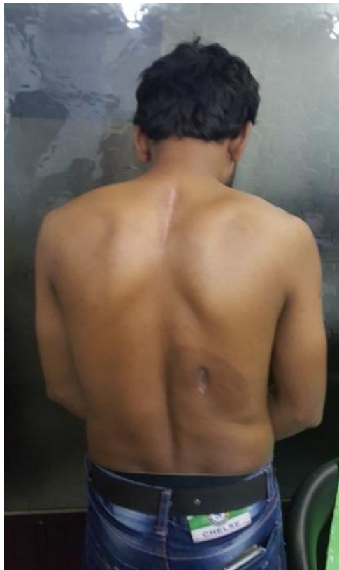
Postoperative photograph of the patient

MRI of the spine revealed a lesion eroding the D1 left hemilaminae at the C7-D1 level which was hypo intense in T1 weighted image and hyper intense in T2 suggesting an abscess. We explored the lesion by standard technique and as soon as we reached the D1 lamina semisolid pus like cheesy material came out. Laminectomy wasn't necessary as the lesion had already destroyed most of it. Liquid pus and debris from abscess cavity were collected and sent for both histopathology and geneXpert. After evacuating the cavity we tried to remove all of the capsule in piecemeal fashion. Vigorous saline irrigation was given and the wound was closed maintaining all haemostatic protocol. Biopsy from the cavity wall revealed granulomatous lesion consistent with tubercular spondylitis. GeneXpert also detected mycobacterium tuberculosis which was not resistant to rifampicin thus confirming our diagnosis of spinal tuberculosis. Patient was advised to start anti-koch treatment. Post operatively his Paraparesis improved and he started walking with support. Now after one month post operatively the discharging sinus in the lower dorsal level has almost healed and he is improving gradually with physiotherapy.