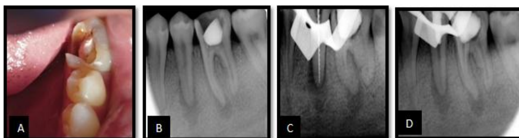
Figure 1: A: Pre- operative intraoral photograph. B: Routine intraoral periapical radiograph showed large periapical radiolucency in 35 and 36. C: Working length determination in 35. D: Immediate post treatment radiograph.

Cavit (3M) was then introduced in the access cavity and with a hand plugger, condensed into the cervical third of root canals. This was followed by GIC restoration (GC) and then later also with composite (3M). Immediate post treatment radiograph was taken (Figure 1D). The patient was recalled for follow up at one month in which the decrease in the size of periapical radiolucency was evident in relation to 35 (Figure 2A). The patient failed to turn up for further appointments for the completion of root canal treatment in 36. The patient then turned up for a seven month follow up which revealed complete resolution of the periapical radiolucency and the healing was evident (Figure 2B). Meanwhile the patient had got the extraction of 36 done against our advice.