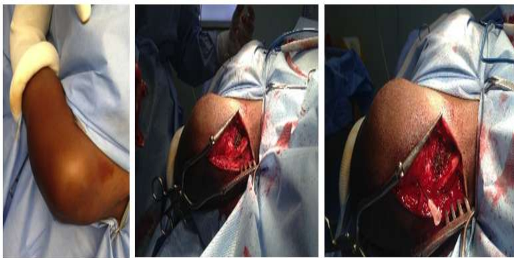
Fig.1. Supine Position

Post-operatively , arm sling was used for 10 days to 2 weeks. Pendulum exercise was started after 24 hours assisted with active flexion and extension movements following by light resisting exercise after 6 weeks was started and complete full range of movements was started after 12 weeks. Postoperative functional outcome was assessed by using PENN score and Constant Shoulder Score. Assessed at the regular interval for 1 year ( pre op – immediate post op – 6 weeks – 6 months – 1 year).