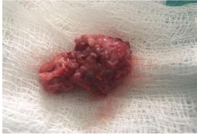
Fig.1. single grey white to grey brown soft tissue mass measuring 3x2x1cms with an irregular surface. Cut section shows grey brown areas. All the tissue was processed.

The tumour was excised under spinal anaesthesia. Specimen sent for histopathological examination (HPE) (fig.1).