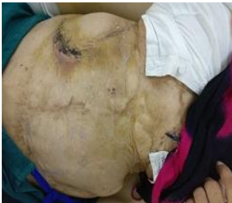
Post Op image of Patient