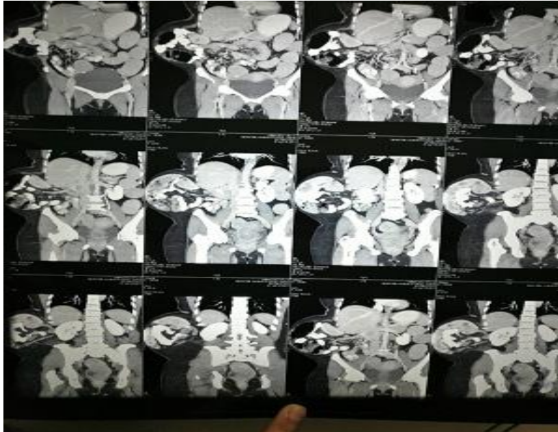
CECT Scan of Abdomen showing lumbar hernia defect