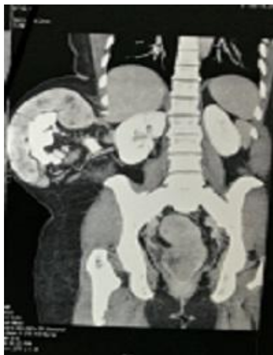
CT Scan showing large defect in Lumbar region.

A 55 years old female presented in surgery OPD of MGMCH with complaints of pain abdomen with a large swelling on right lumbar region. Patient had history of blunt trauma abdomen 17 years back and had avulsion injury abdomen with hemoperitoneum and posterior dislocation of hip for which she underwent exploratory laparotomy with reduction of hip dislocation and debridement and skin split grafting for avulsion skin of anterior abdominal wall. Clinical examination revealed slight abdominal pain but no guarding and rigidity and a lump was palpable in right lumbar region. Routine haematology came out to be normal. USG abdomen revealed thinning of lateral abdominal wall with protrusion of intestinal contents through it. CECT whole abdomen revealed a large defect of 9 cm in the posterior abdominal wall in right lumbar region with small bowel loops, mesenteric fat, ascending colon and superior mesenteric vessels herniated through it. The patient was taken for open hernia repair. Abdomen was opened by curved incision in left lateral position.. Lumbar hernia was present with defect of size of approx 10 cm. Contents were preperitoneal fat, bowel loops. Lumbar hernia reduced and repaired by polypropylene mesh. Post op was uneventful. There is slight skin flap necrosis present in suture line which was managed conservatively and patient was discharged satisfactorily on 5th post operative day.