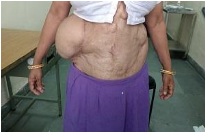
Pre Op Image of Patient