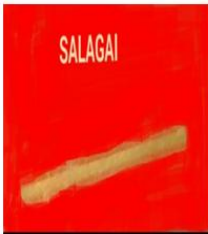
Fig.2 an surgical instrument salagai