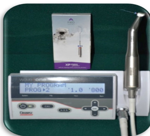
Figure 1: XP-endo finisher.

• Group 1: the canals were cleaned with the XP-endo Finisher (FKG Dentaire, La Chaux-de-Fonds, Switzerland) (Fig.1). After working length adjustment to 10mm with the provided tube, the Finisher was cooled down with ethyl chloride spray while it is inside the tube. After irrigating the canal with 1.0ml 2.0% NaOCl, the Finisher was removed from the tube and activated while its tip was inside the canal. The Finisher was activated for 60 seconds inside the canal using gentle 7-8mm lengthwise movements to contact the full length of the canal.