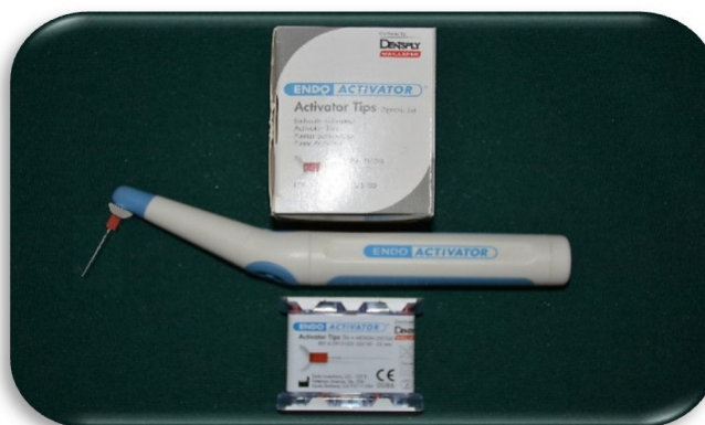
Figure 2: EndoActivator system.

• Group2: the canals were cleaned with the EndoActivator sonic irrigation system (Dentsply Tulsa Dental Specialties, Tulsa, OK, USA) (Fig.2) using the medium-size polymer tip (25/.04). After irrigating the canal with 1.0ml 2.0% NaOCl, the tip was fitted passively inside the canal, 2mm shorter than the working length, and activated at 10,000 cycles/minute for 60 seconds with pumping action in short 2-3mm vertical strokes.