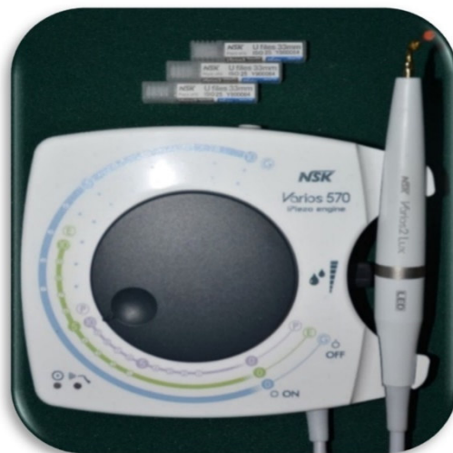
Figure 3: NSK Varios 570 iPiezo engine.

After cleaning the canals for each group, the canals received a final rinse of 5.0ml 2.0% NaOCl, followed by dryness with ProTaper NEXT paper points size X4. Then the canals were sealed coronally with self-cure glass ionomer cement as a temporary filling to prevent the entry of debris during sectioning and prevent contamination of the root canal space [11-13] .