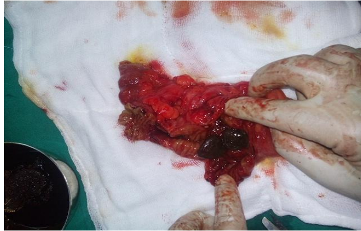
Photo 2 - Showing enteroliths in resected bowel loop