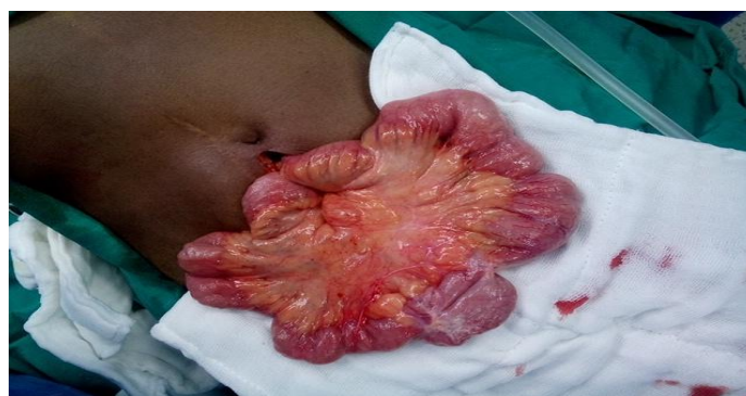
Photo 1 - Showing three strictures with dilatation of intervening segments