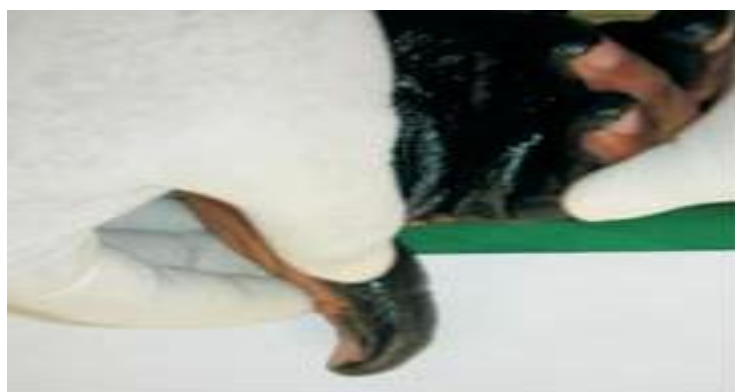
Figure 2: Inked hand showing making of finger prints