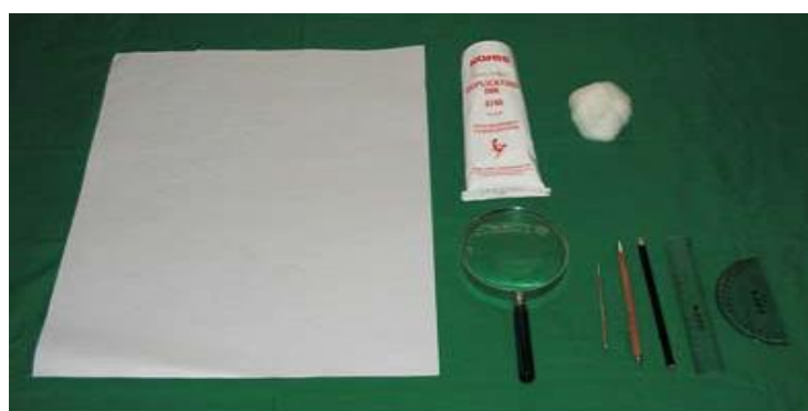
Figure 1: Armamentarium for making palm and finger prints