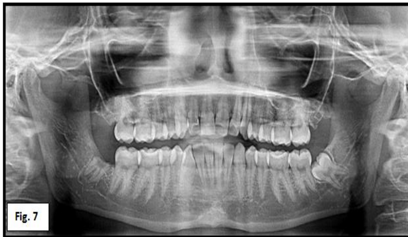
Fig 7: immediate post operative opg.

The patient was seen for a follow-up visit at seven days postoperatively and sutures were removed. The surgical sites appeared to have healed normally without any pain. The absence of paresthesia in the IAN and lingual nerve distribution was assessed by the patient's subjective response of normal sensation with sharp, blunt, and light touch. A follow-up panoramic radiograph was obtained showing the eruption of roots of third molars and away from the nerve which can be removed safely without damaging IAN (Fig. 7).