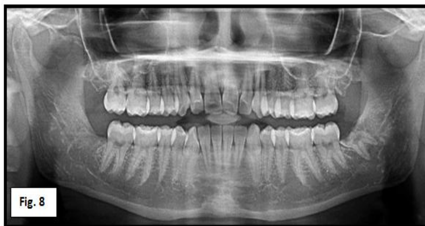
Fig.8: post Op OPG after one year

The patient was followed up at regular intervals of every 15 days for the first 2 months and then for every 1 month for up to 1 year. At the end of 1 year, it was observed that the roots had subsequently erupted from their previous position and acquired a new superficial position away from the IAN, which was now favorable for removal. The roots were removed, and no subjective signs of pain or paresthesia were observed in the follow-up visits (Fig. 8).