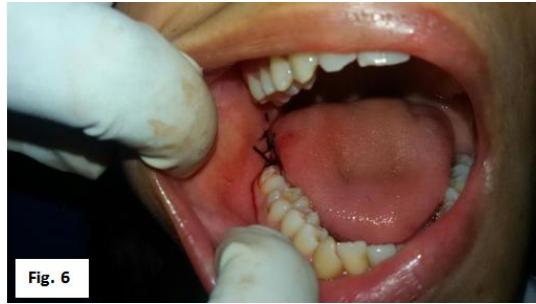
Fig.2-6: Surgical procedure and suturing

The patient was seen for a follow-up visit at seven days postoperatively and sutures were removed. The surgical sites appeared to have healed normally without any pain. The absence of paresthesia in the IAN and lingual nerve distribution was assessed by the patient's subjective response of normal sensation with sharp, blunt, and light touch. A follow-up panoramic radiograph was obtained showing the eruption of roots of third molars and away from the nerve which can be removed safely without damaging IAN (Fig. 7).