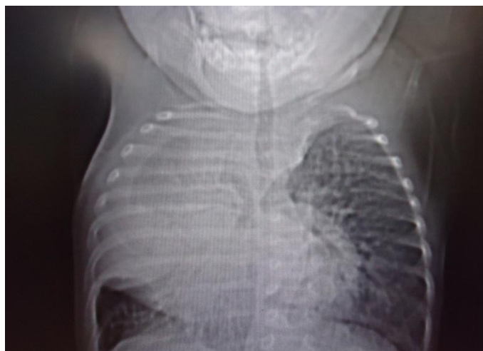
Fig: 1. Frontal chest radiograph shows nearly complete opacity of the right hemithorax and contralateral mediastinal displacement. No rib destruction or pleural fluid collection is seen.