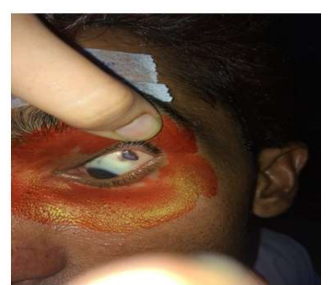
Figure 2: Preoperative photograph of a 18 year old male patient showing a subconjunctival large foreign body embedded in pars plana ciliary body area of eye

A 18 years old male presented in our outdoor with history of decreased vision in left eye for 3 months.